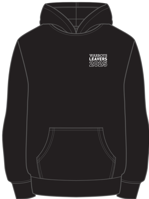
Artwork W: 70mm