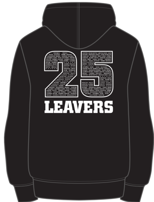
Artwork W: 270mm

On the rear of the hoodies, their first names can be printed. You can choose not to have the first name printed if you wish.